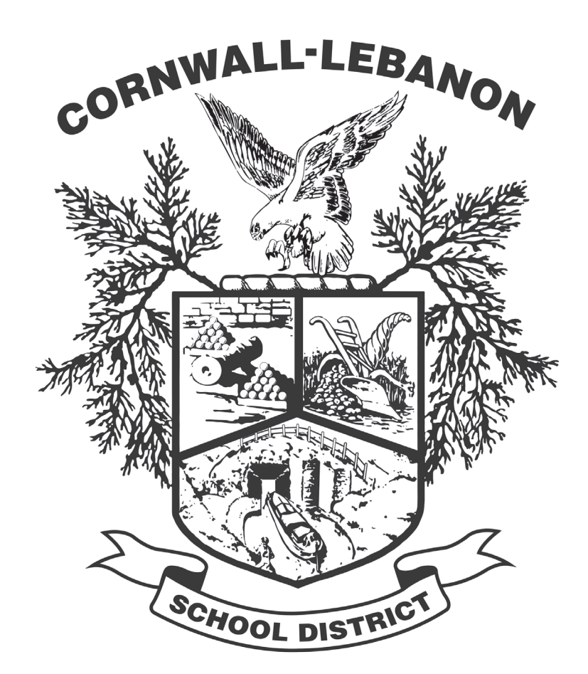
"Empowering Our Students to Meet Their Individual Potential"