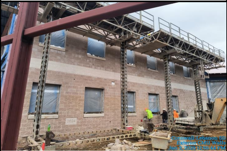
Exterior Veneer CMU Wall