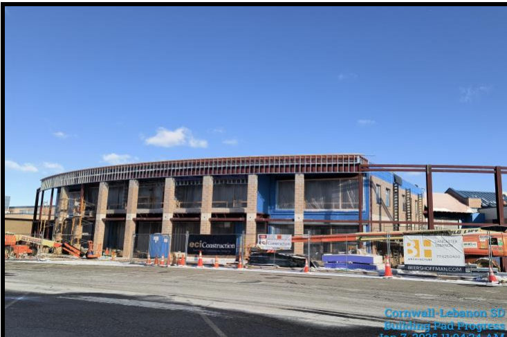
Building Pad Progress

Cornwall-Lebanon School District Empowering students to reach their individual potential