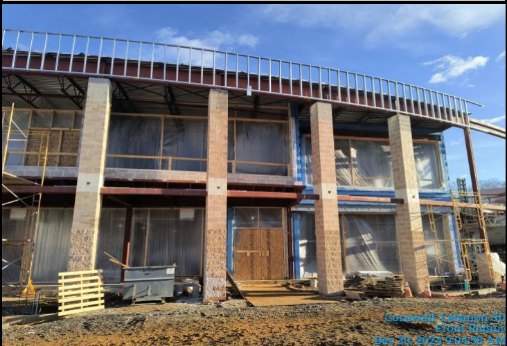
Front of Building Radius