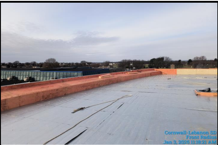
Front Radius Parapet Wall