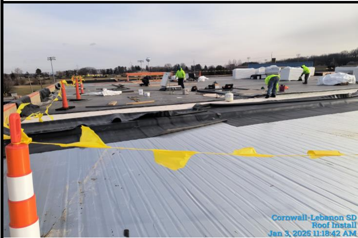
Rubber Roof Installation